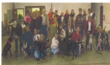
Howliday Party Attendees

As always the IDDC Howliday Party was a huge success. The afternoon was filled with good food and lots of fun and games. The day was a wonderful opportunity for many members to socialize with other members, members' families and all their dogs.