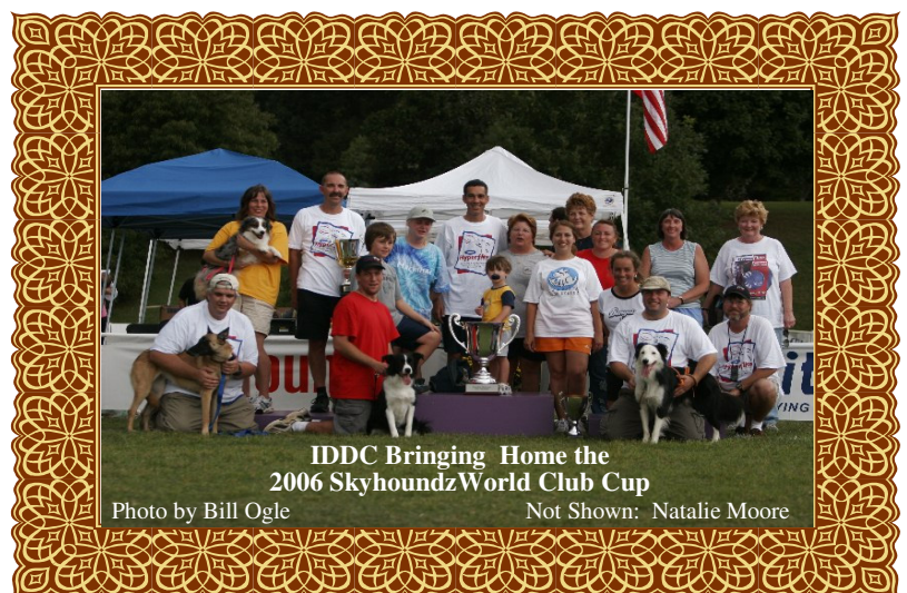
IDDC Bringing Home the 2006 Skyhoundz World Club Cup Not Shown: Natalie Moore