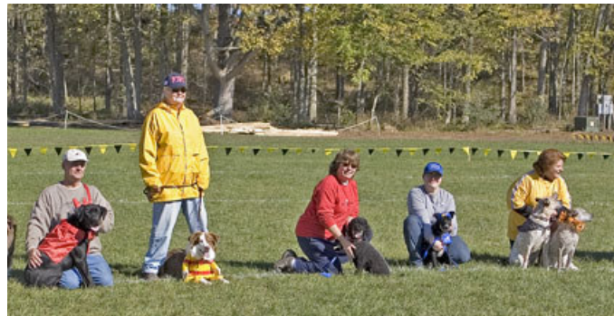
The Devil Fireman Pepe LePew Policeman Jesters