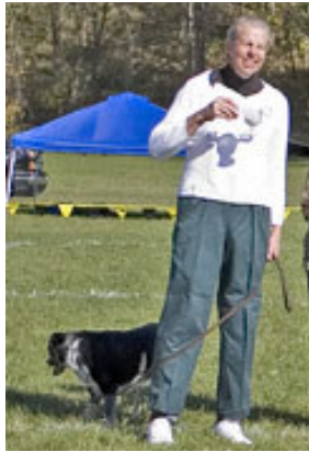
Cousin Eddie & Snots