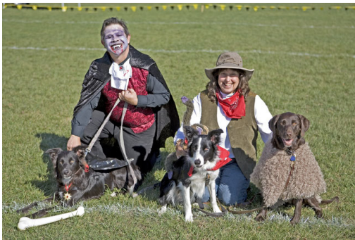
Dracula and his Bat