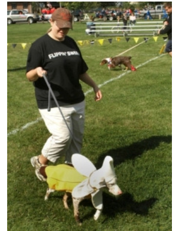
A Banana Delight Worthy of Whipped Cream and A Cherry On Top