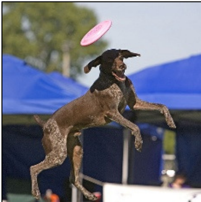
Bruno Gilchrist pleads...Mom, next time a BLACK beret. Please?