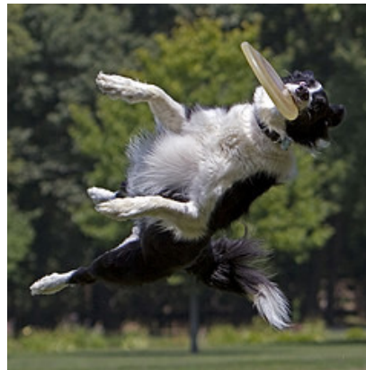
Rudy Corso says: "I flip for discs!"