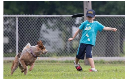
Left & Center – the top two pairs qualifiers, Right – our youngest competitor for the weekend!

IDDC added two new events this year – the Itty Bitty held in Frankfort, Indiana on July 27 as part of the town's Hotdog (i.e. wiener!) Festival. The competition was friendly, if not amusing as the wind insisted on blowing the discs every which way except for the desired path. But IDDC is planning on being there again in 2014 so be sure to join the fun if you missed the first round in 2013.