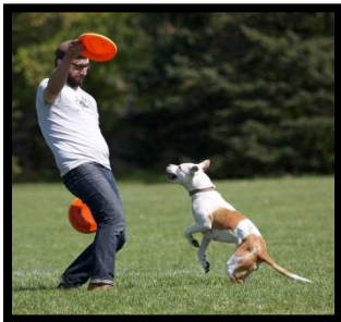
Crites & Hemingway