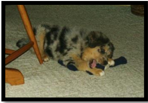
Lily at 3 months